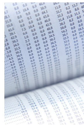
Dividends as a Percentage of Total Returns

However, according to S&P, corporations are beginning to favor stock buybacks rather than dividend increases as a way