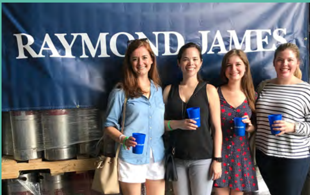
Raymond James employees enjoying themselves during a crawfish boil at Nola Brewing