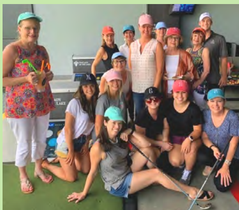
Support staff in Baton Rouge enjoyed a team building outing to Topgolf!