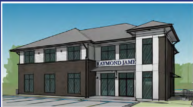
Artist's rendition of new Mandeville Office