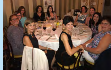
Visiting before dinner at Arnaud's!