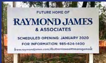
Signage in place at the construction site