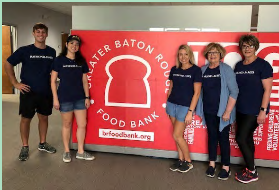
Baton Rouge branch RJ Cares volunteers at the Greater Baton Rouge Food Bank

THANK YOU FOR BEING A PART OF OUR EFFORT TO BE MORE INVOLVED IN OUR COMMUNITIES!