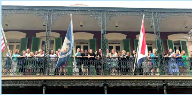
The entire group on the balcony of Arnaud's. What a fun evening!

We are beginning to plan our event for next year and we cannot wait to make it even better than the first!