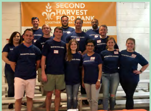
New Orleans RJ Cares volunteers at Second Harvest Food Bank