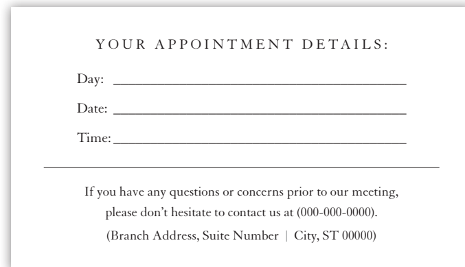
Appointment Card – Back