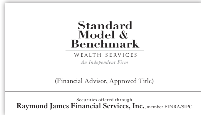
Appointment Card – Front