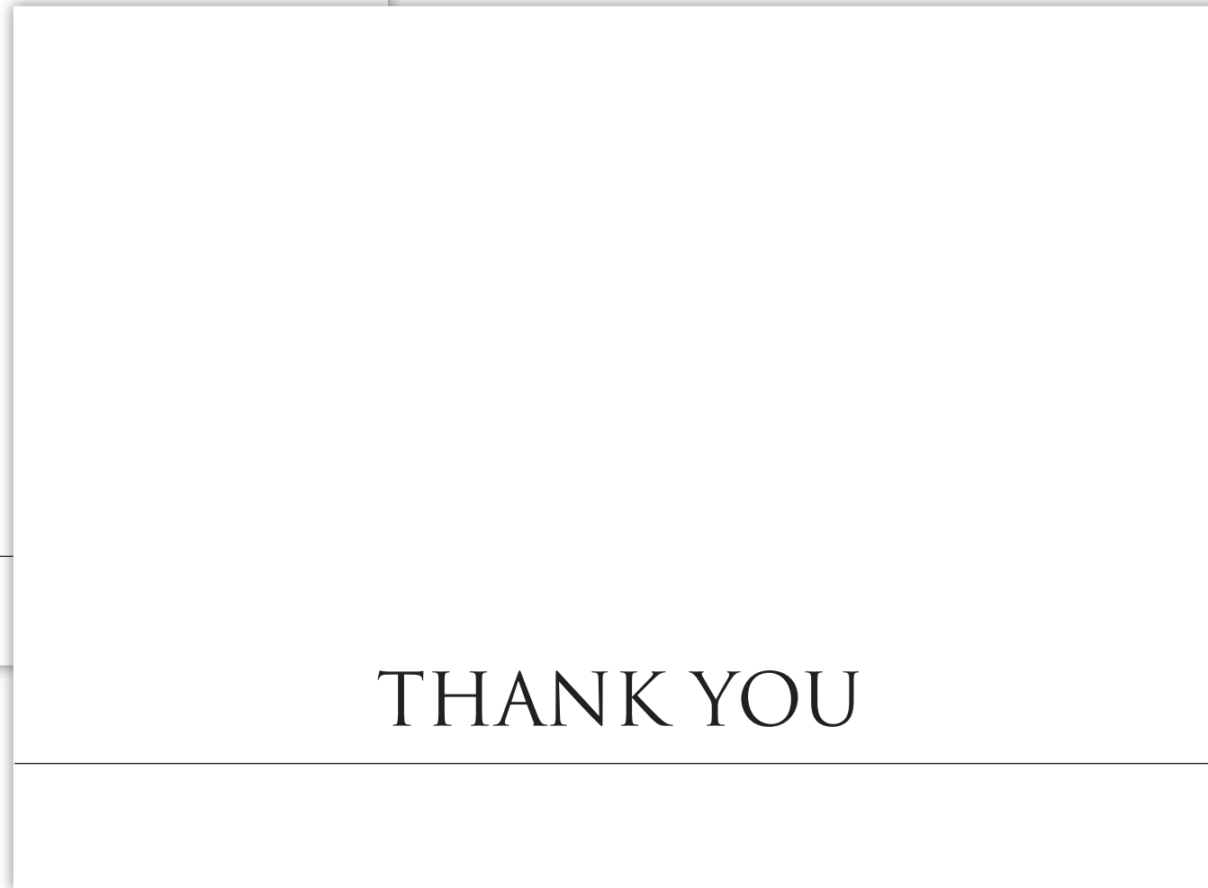
Thank You Card