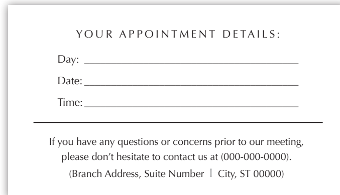
Appointment Card – Back