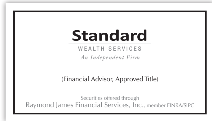
Appointment Card – Front