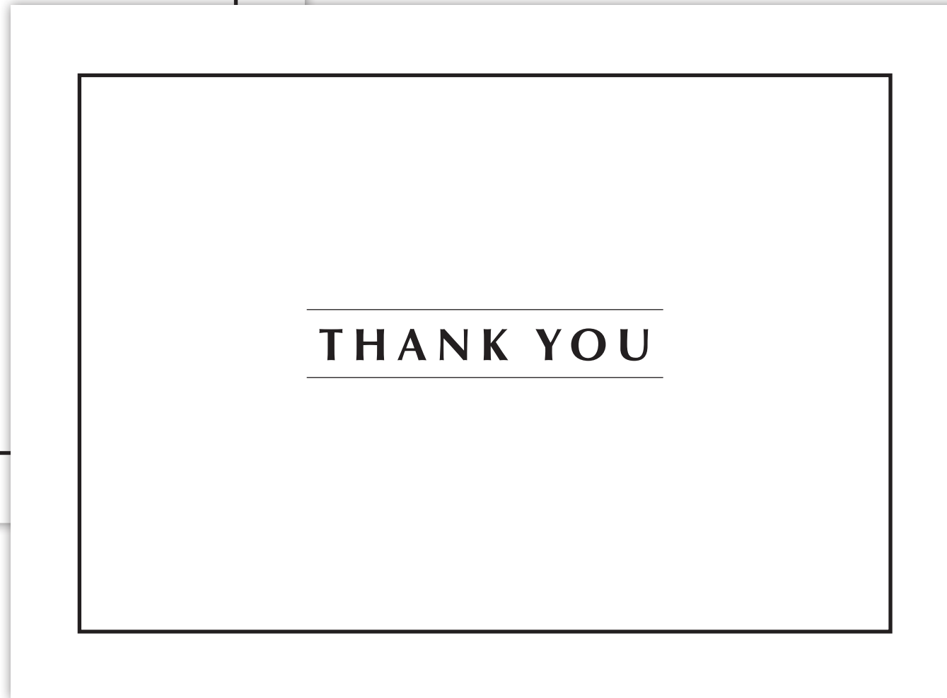
Thank You Card