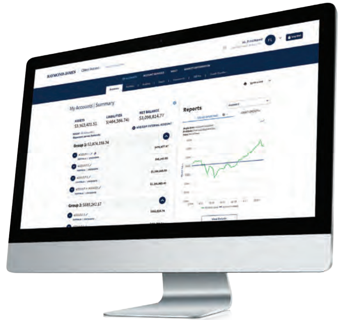
Client Access site

Mobile Access – The Client Access mobile app is available on Apple and Android. The app allows for secure access to Raymond James and external account data, the Vault and advisor information. It also offers mobile check deposit capabilities.