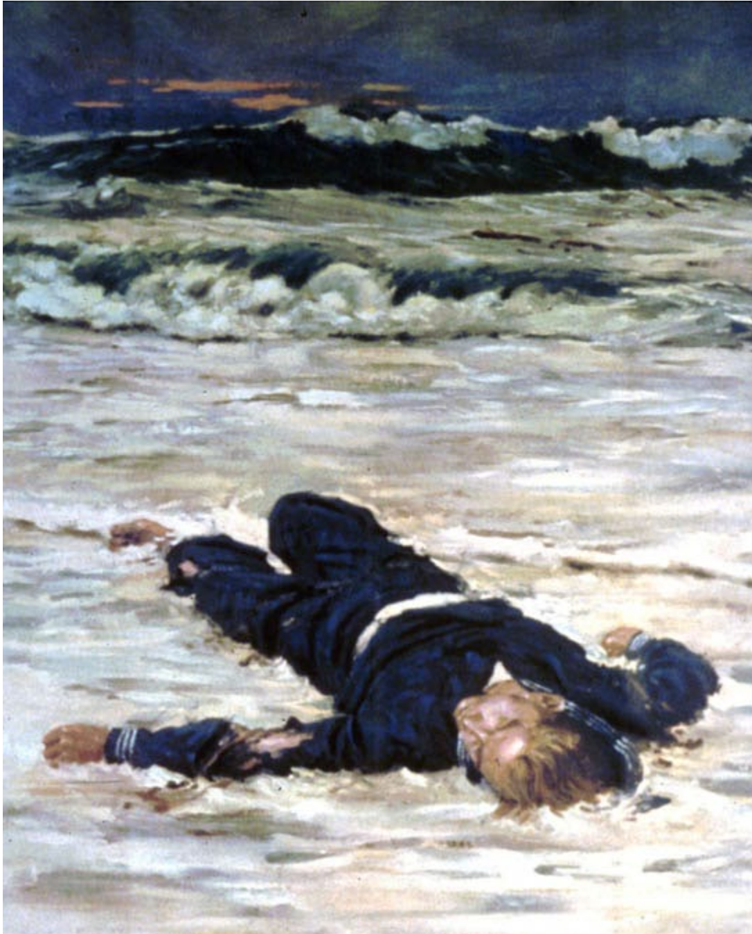
"A Careless Word, A Needless Loss" US World War II propaganda poster, warning against the disclosure of information that might lead to unnecessary deaths, by Anton Otto Fischer / Office of War Information (1943).