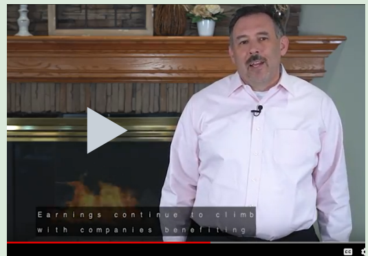
4th Quarter Market Update Video

"Riches do not consist in the possession of treasures, but in the use made of them."