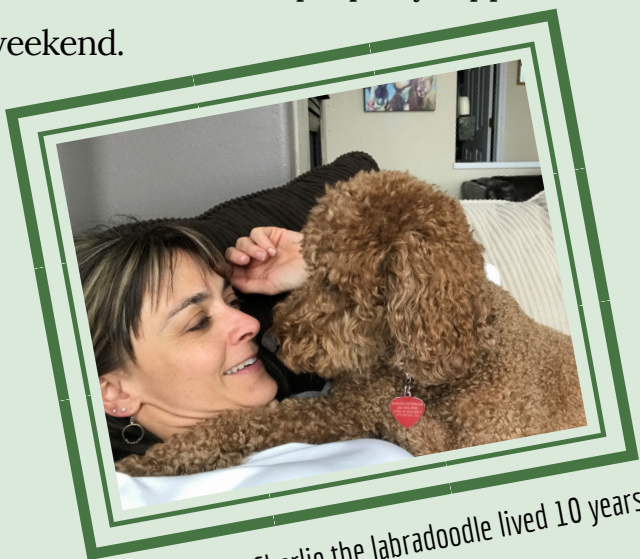
Charlie the labradoodle lived 10 years

In late July, I was able to help our uncle with his property in Edwards, CO. It felt good to put on old jeans and work gloves, and sweat a little. A hike on his property topped off the weekend.