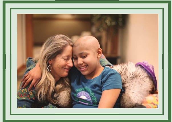
Ronald McDonald House helps sick kids