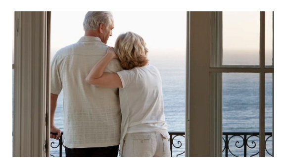
Through the back door to bigger retirement savings