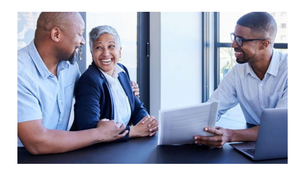
Have you hired the right tax accountant?