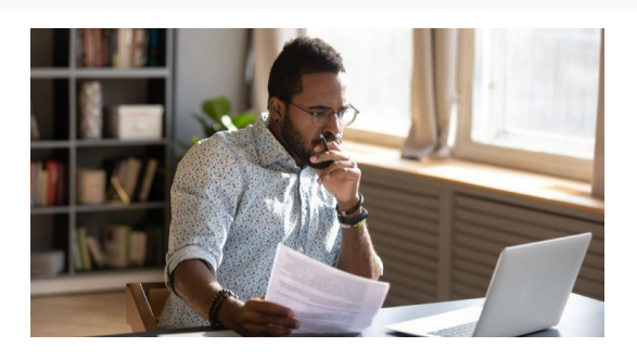
3 Biases That Can Sabotage Your Wealth