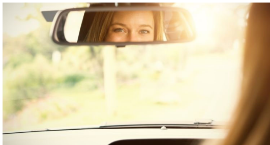
We All Have Money Blindspots