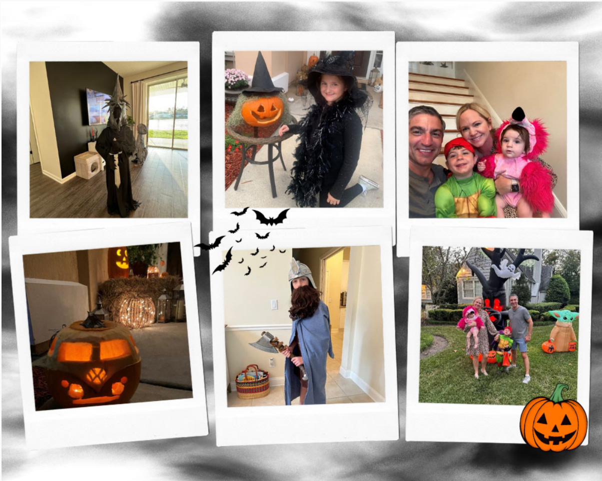
We had tricks, we had treats, and another Halloween is in the books!