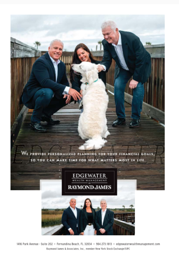
From Us To You