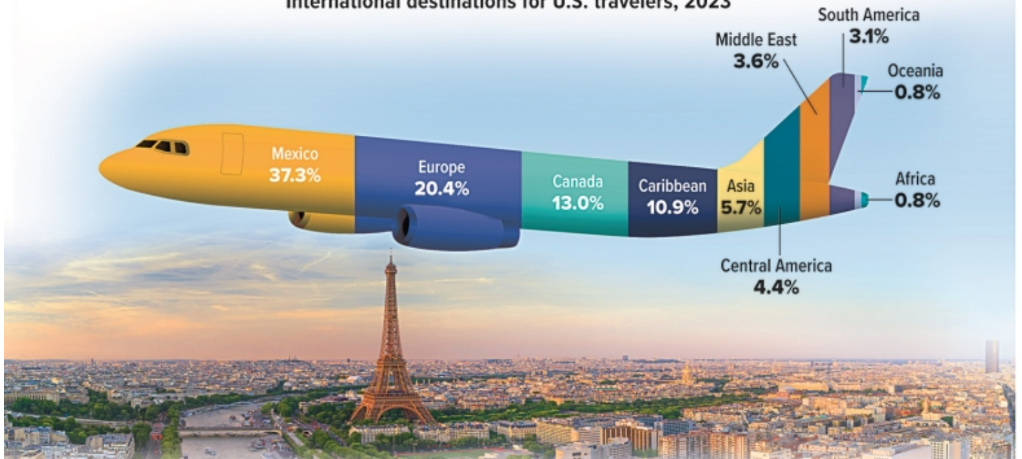
International destinations for U.S. travelers, 2023