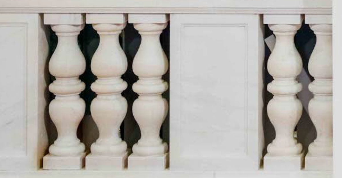
60TH YEAR ANNIVERSARY OF