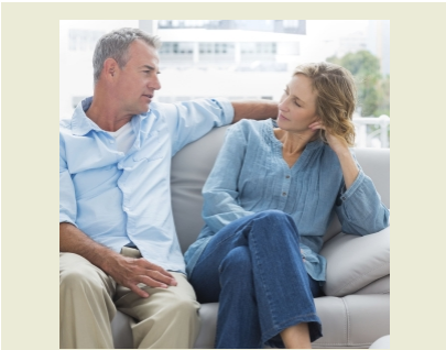
Market losses on the front end of your retirement could have an outsized effect on the income you might receive from your portfolio.