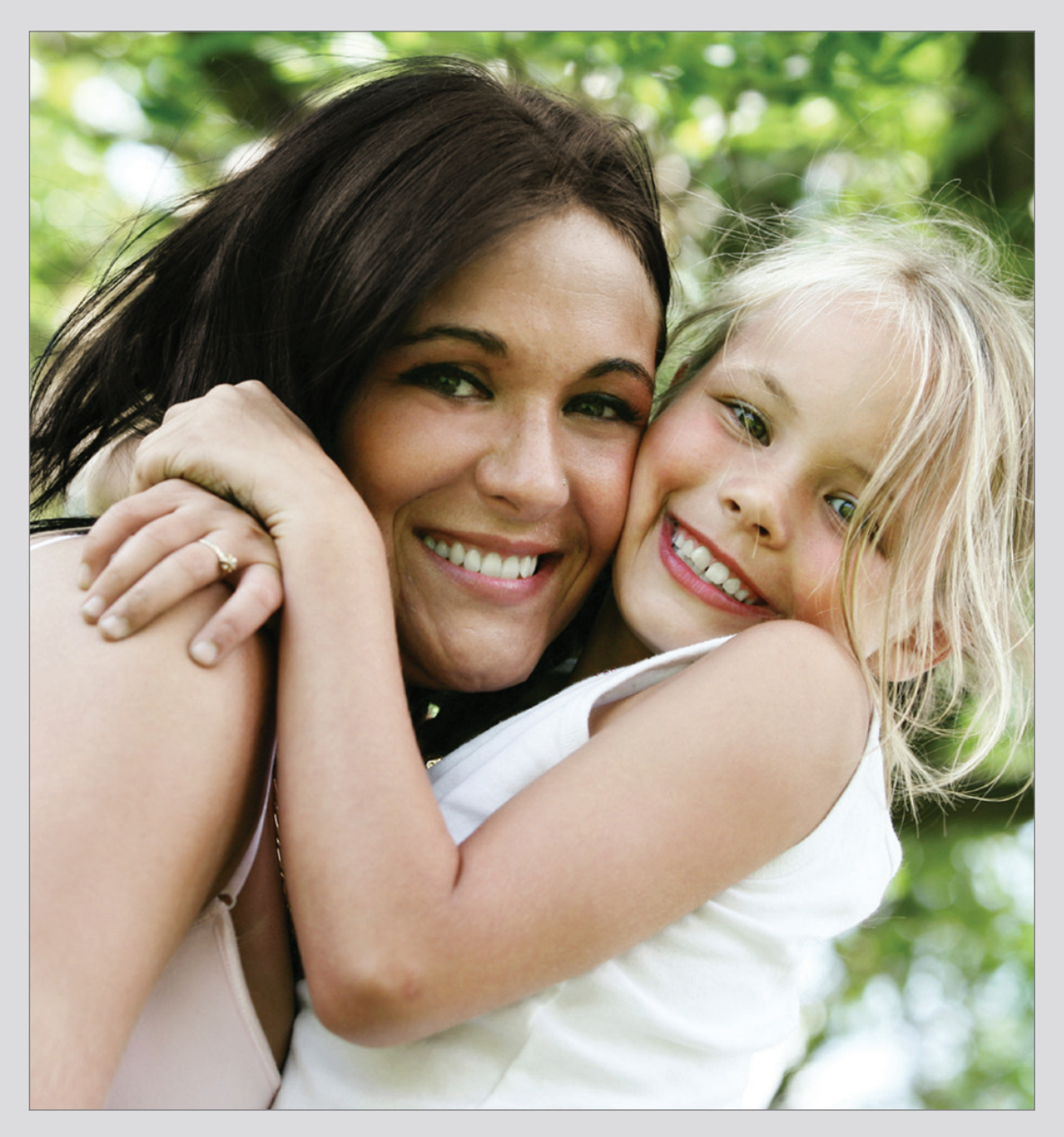
Creating a financial plan prepares you for milestones not only in your future, but your child's as well.